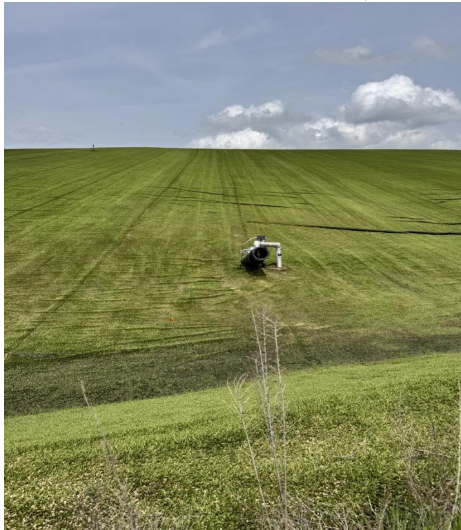
Photograph 4: View of south side of Area 4, above LCS-9 showing sagging closure turf.