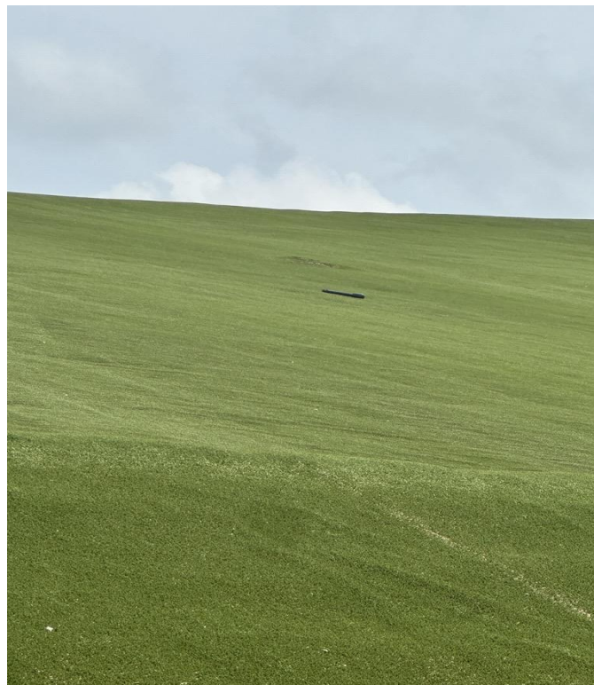
Photograph 6: View of west side of Area 1-2, between LCS-1 and LCS-2 showing damaged gas vent.