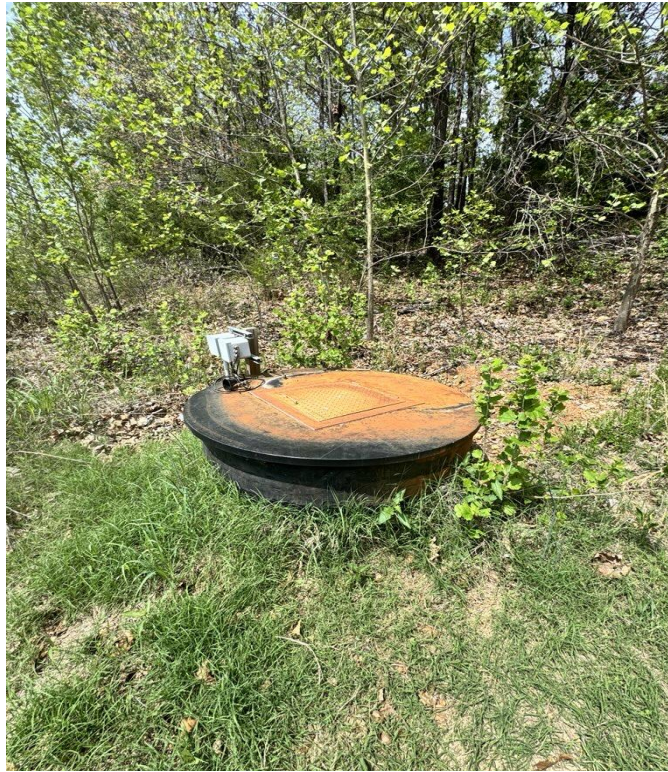
Photograph 1: View of VLCS-1. Staining from past overflows is visible on the lid.