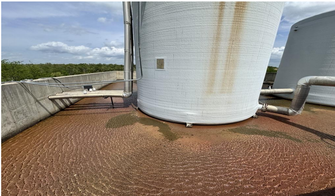
Photograph 2: View of minimal stormwater in leachate tank containment.