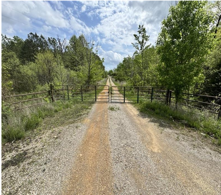
Photograph 7: The signage at the entrance gate has been removed.