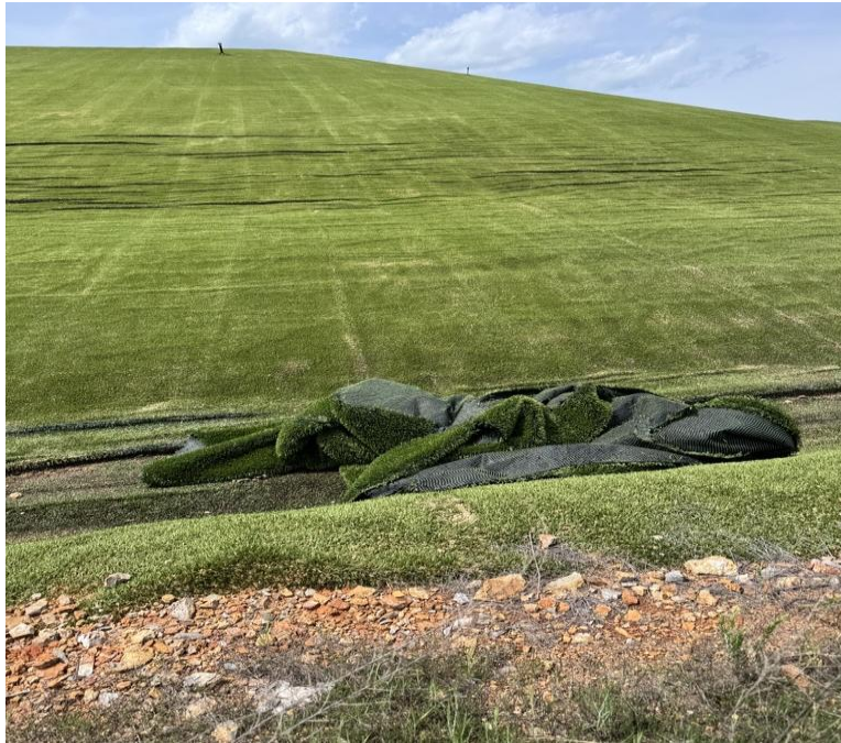
Photograph 5: View of south side of Area 1-3, near LCS-7 showing damaged closure turf that has migrated to the ditch at the bottom of the slope.