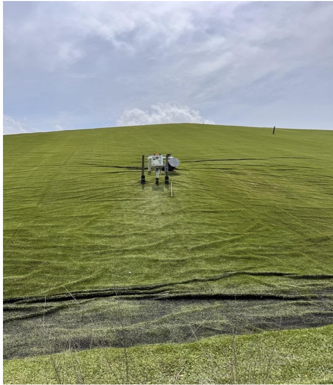
Photograph 3: View of DCT-1 on north side of Area 1-2, at 36.46181, -92.45045.